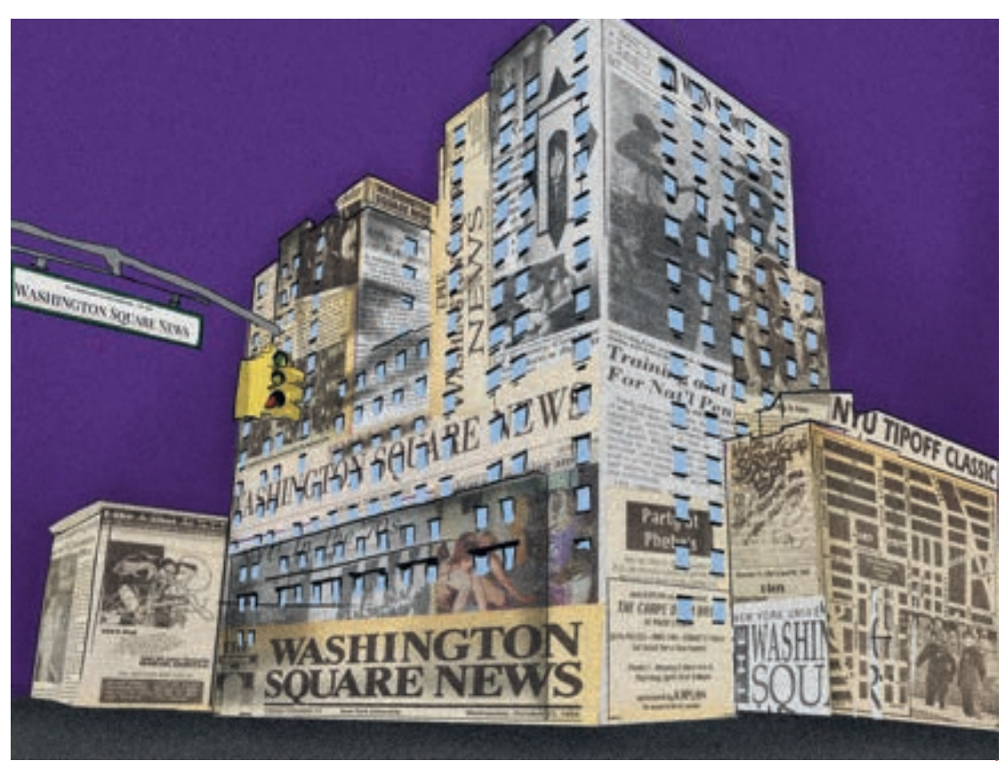
Aaliya Luthra / WSN