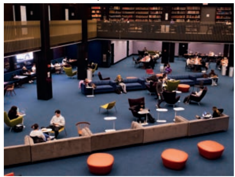
Bobst Library also celebrated its 50th birthday this year. The first floor has recently undergone renovations, replacing the old black-and-white tile floors with blue carpets and colorful furniture.